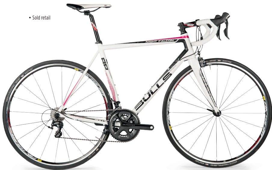
Aluminum frame with sporty seating position, components above average for this price range. Little room for the feet.